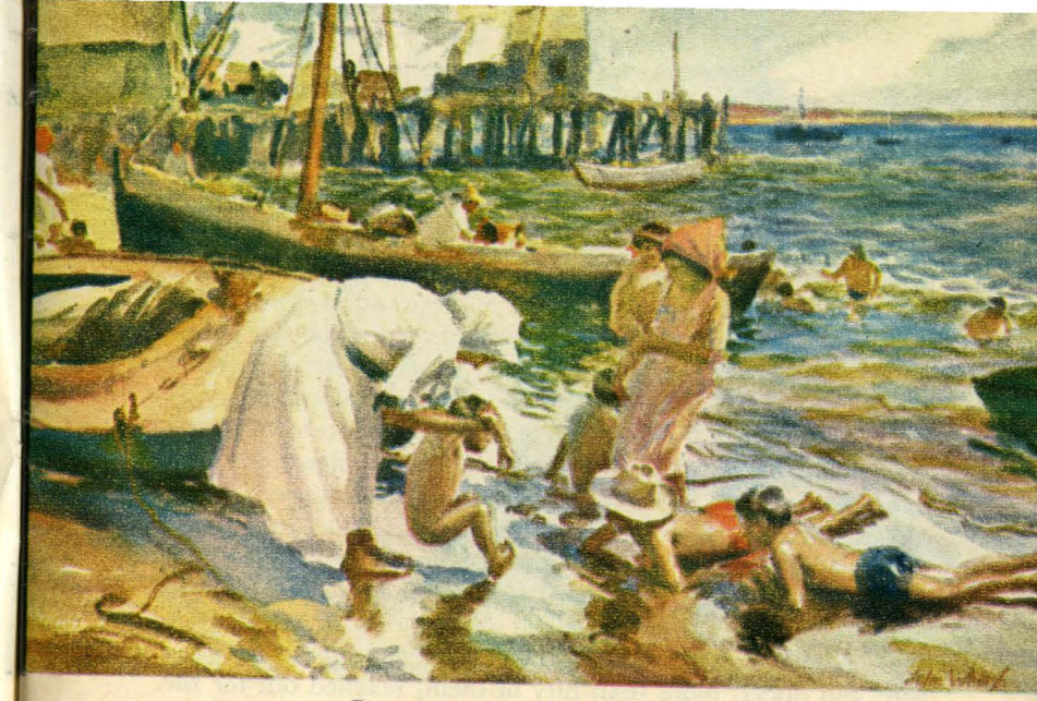
Portuguese children on the beach

Plan to visit Provincetown in the first half of the week when the traffic along the beautiful new Mid-Cape Highway is so much less than on the weekends. You will know that you are approaching the promised land when, as you pass through Orleans, you see a sign reading "First Encounter Beach." This