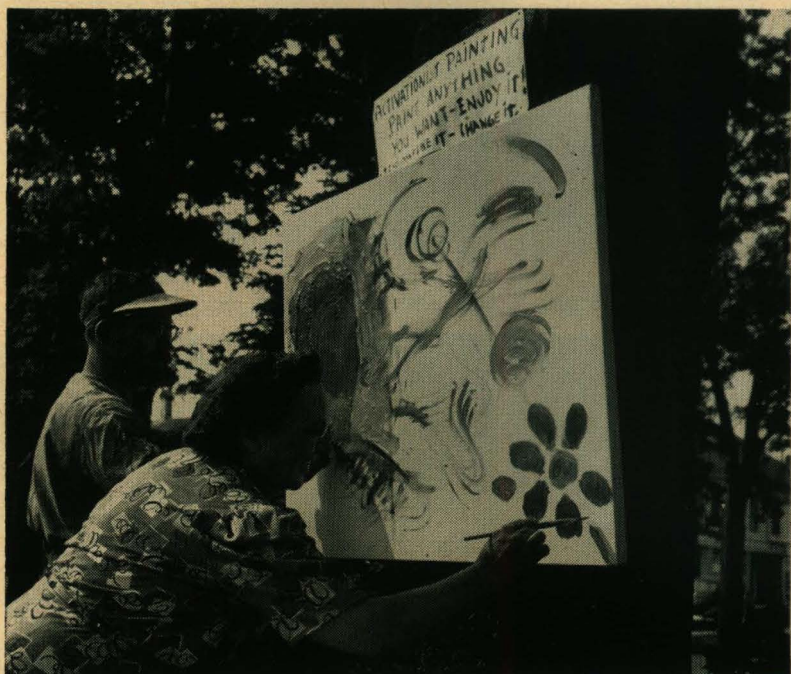
TWO AT A TIME , eager artists add to the community painting. While the man puts doodles on the face, a woman brightens one corner with a sunflower.