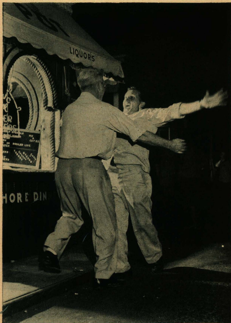
CULT GREETING is a loud-whooping, open-armed collision. These Activationists, happy to see each other, are traveling salesmen for bronzed baby shoes.