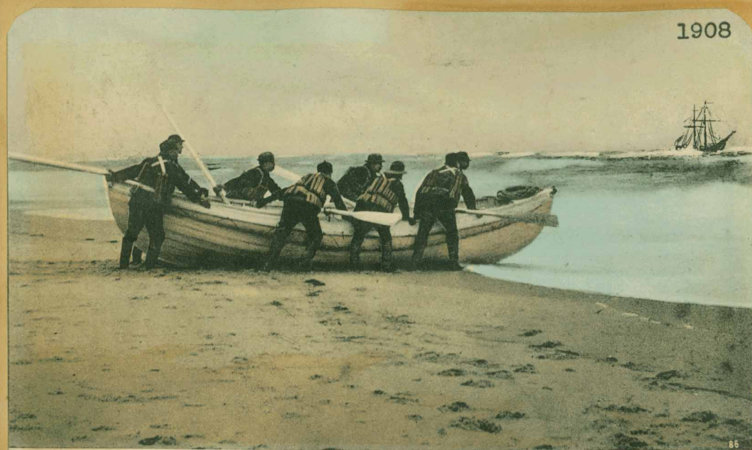
Launching of Lifeboat.