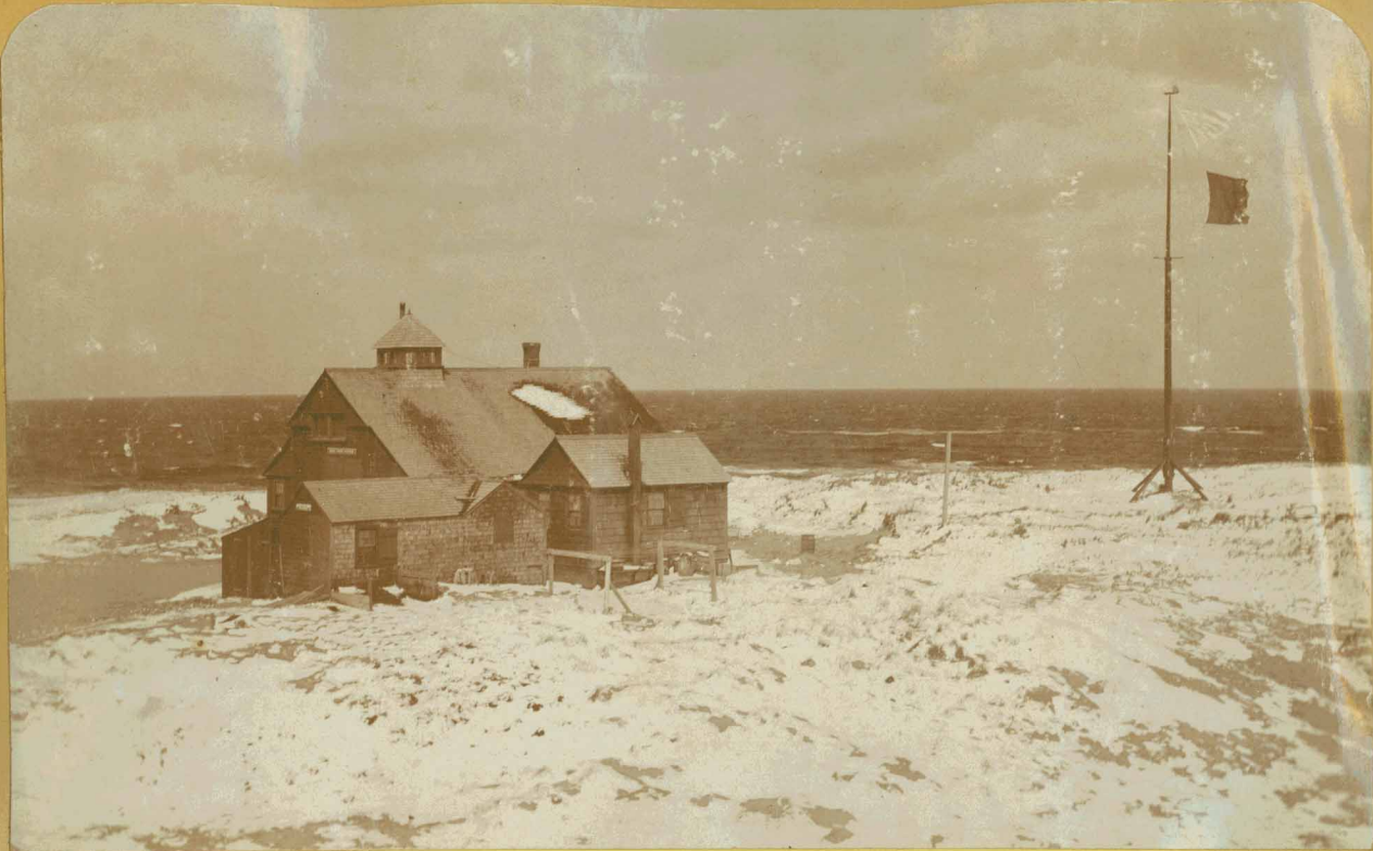
quarters for Sea Shells and as of the Race Point