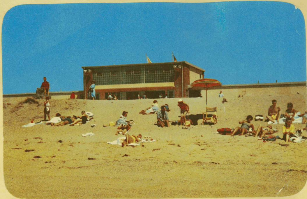
The Bathhouse from Beach - - 1954