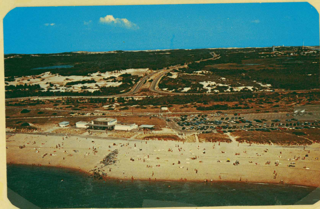
- 1976 -