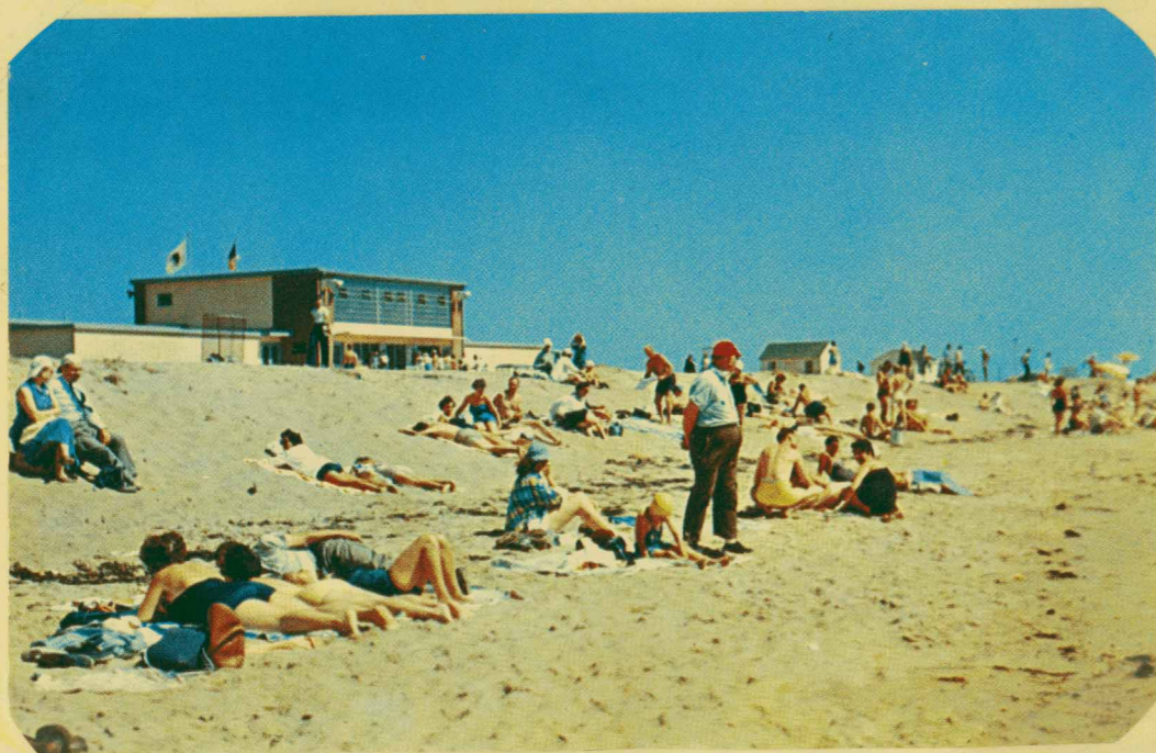
- 1961 -