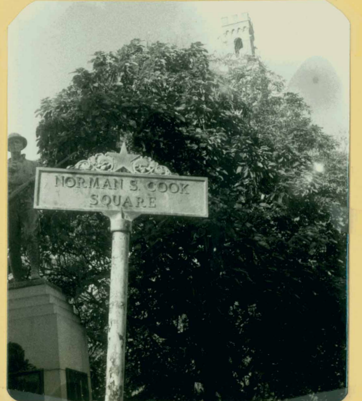
Norman S. Cook Square Sign on corner of Ryder Street. Can be seen in left corner of preceding postcard