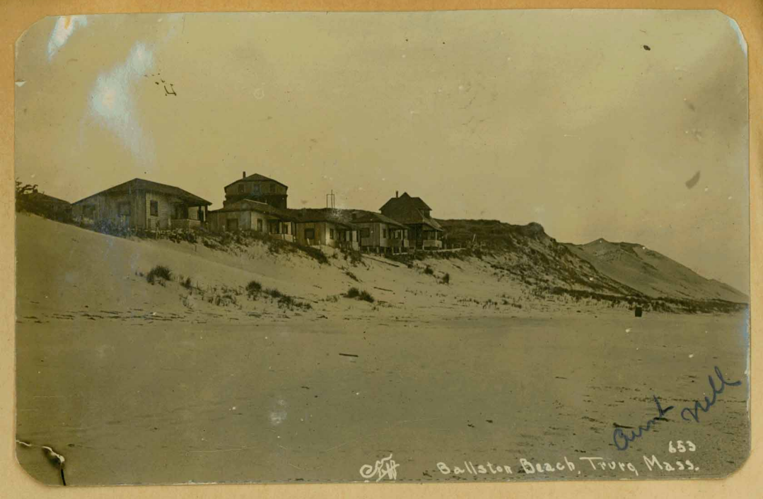
- 1910 -

Note house with cupolas, far right. This same house is on the left in the picture below.