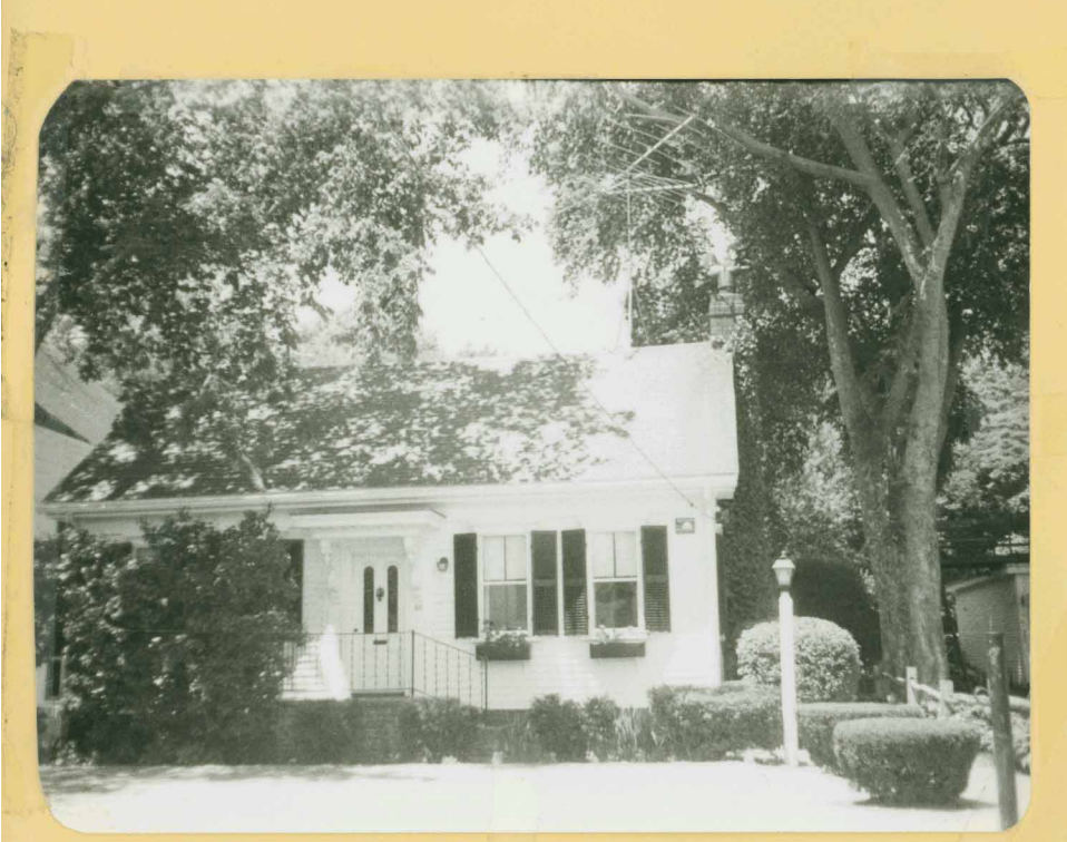
46 Commercial Street, opposite the Prince Freeman House. - June 18, 1981