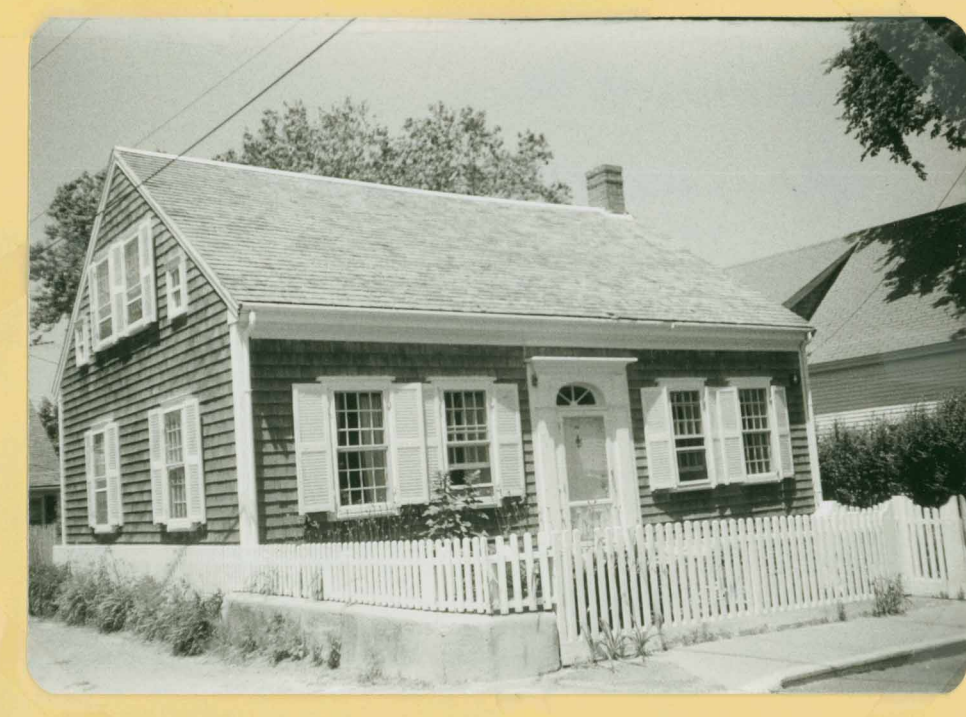
64 Commercial Street - - - June 18, 1981