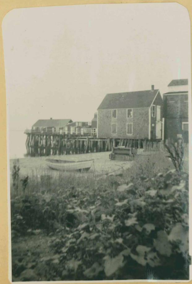
Where the Wharf Theater was. -September 1948