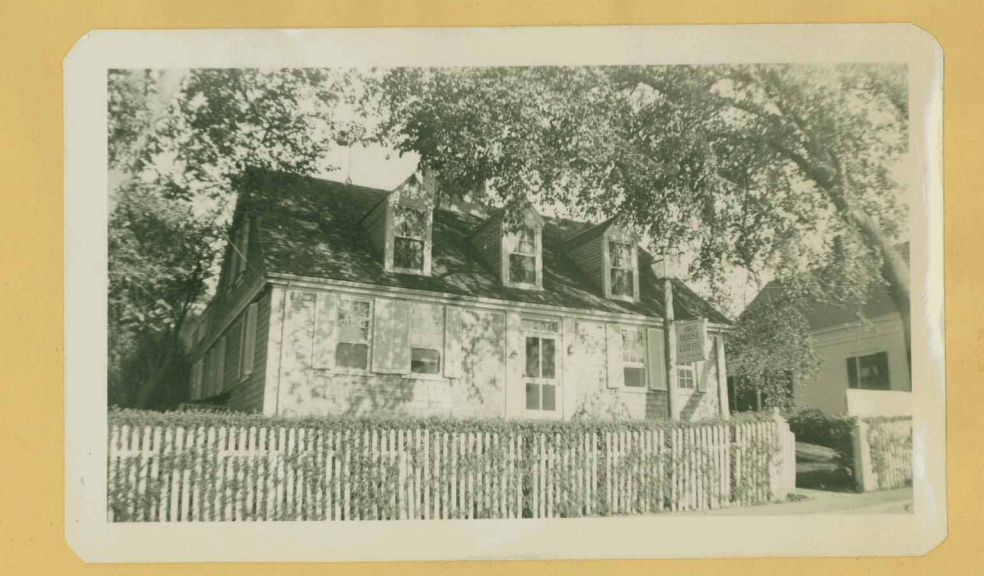
Here is the 3-gabled house showing in all preceding pictures. Taken Sept. 1952 Sign reads: "1807 House. Guests. Built 1873 - Moved 1807." See note against large picture on preceding page. This house now belongs to Hubert Summers. (See scenes around depot.)