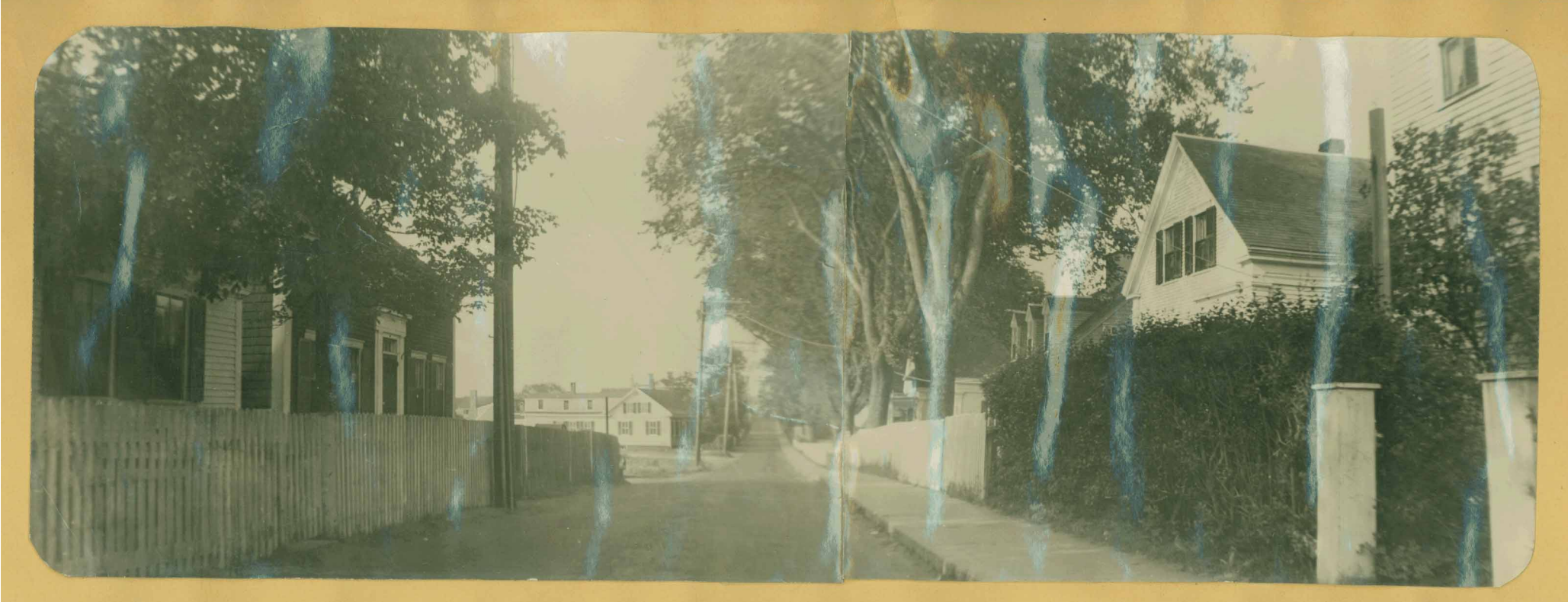
Same scene as preceding page, taken in September 1944. Note change in the foliage. Marston House, left. The Prince Freeman house is third on left (in the sun). See article a page or two ahead.

Varant lot - where west. Odd Illerage used to Be