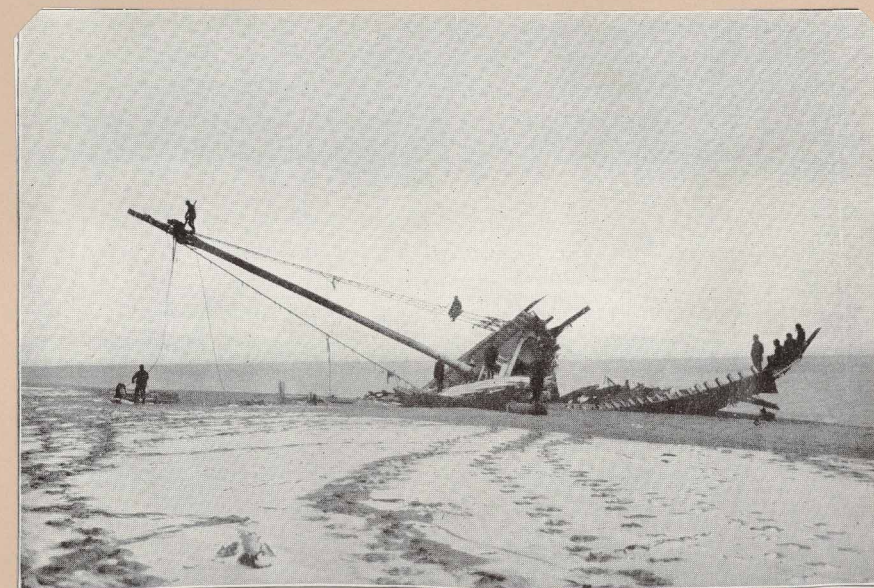
BEACH COMBERS AT WORK STRIPPING THE WRECKED FISHING VESSEL FORTUNA.

When the time for their patrol arrives, the surfmen set out from