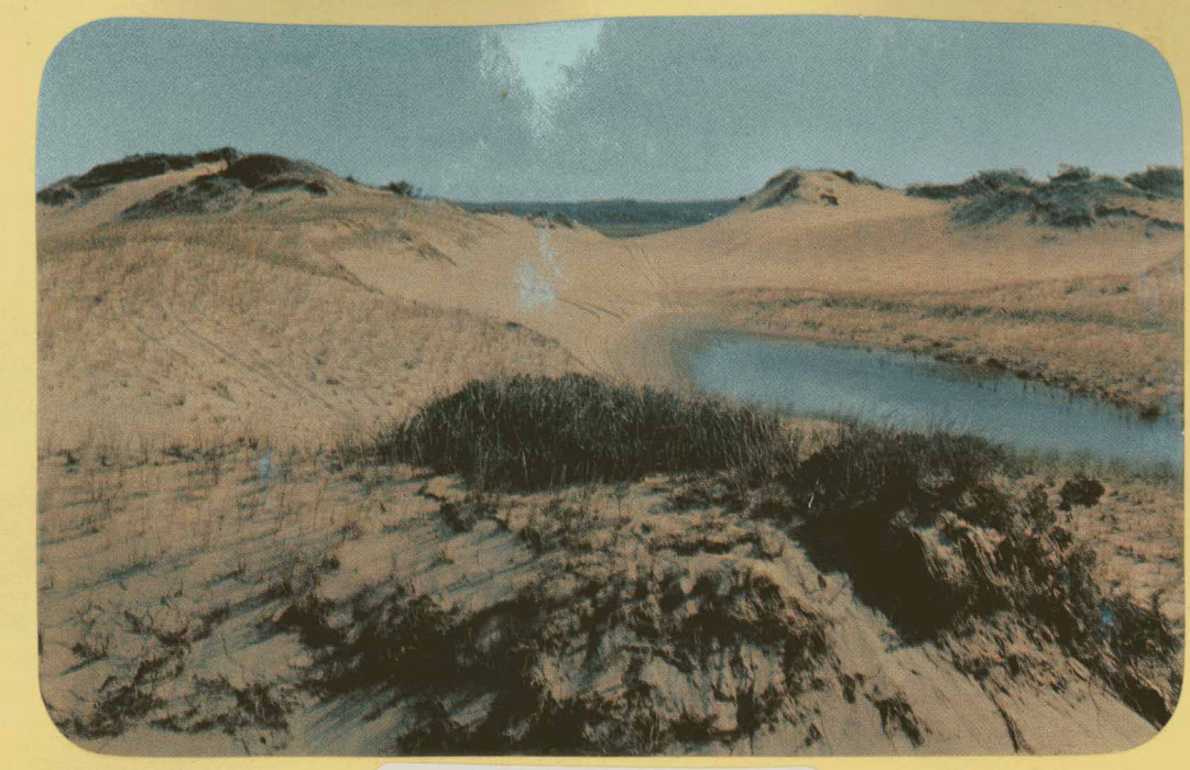
17—SAND DUNES ON CAPE COD, MASS. The Sand Dunes of Cape Cod at frequent intervals are most picturesque and an everpleasing subject for artist and picture maker. The fierce gales of winter whirl them into fantastic pinnacles and smooth and shining mounds.