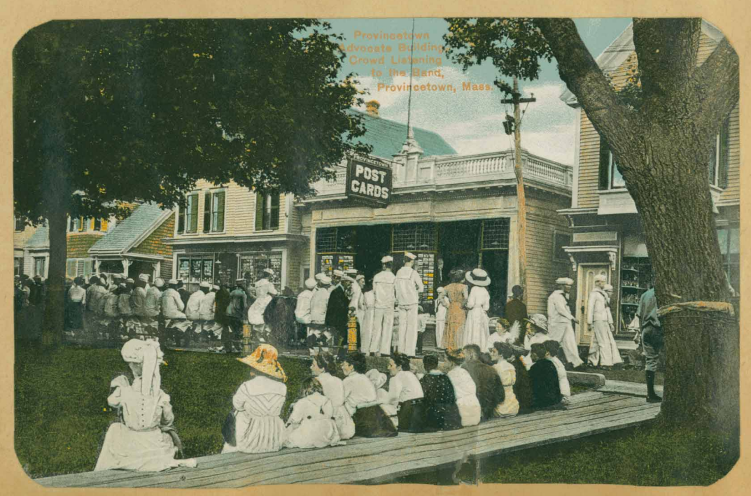
Town Hall Yard, possible the day the corner stone of Pilgrim Memorial Monument was dedicated - August 20, 1907.