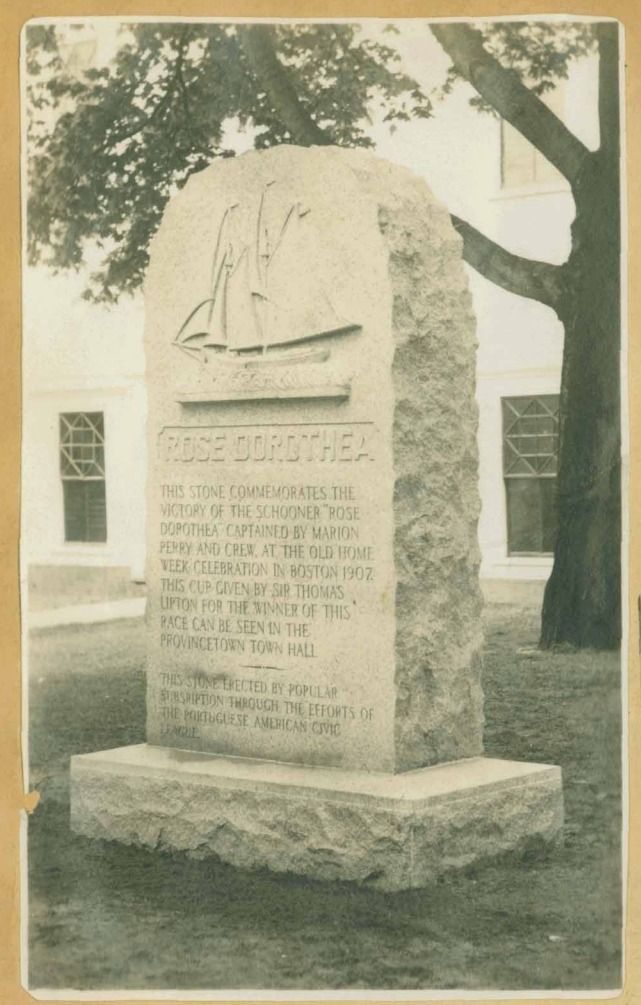
In front of Town Hall - 1909. (see preceding picture.)

see also "the Provincetown Fisherman" section on wharf.)