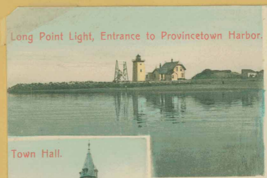
Long Point Light, Entrance to Provincetown Harbor.

Provincetown 1856 with old Town Hall on Town Hill. See story preceding page and same picture, only scene is reversed