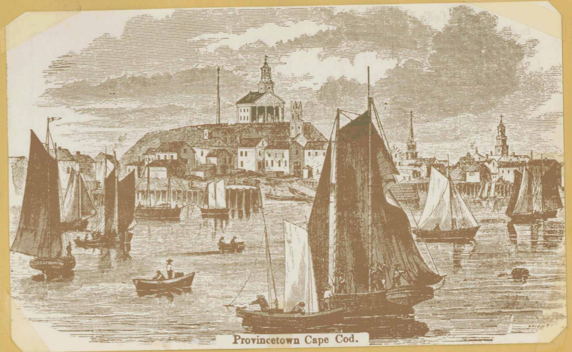
Provincetown Cape Cod.

Provincetown 1856 with old Town Hall on Town Hill. See story preceding page and same picture, only scene is reversed