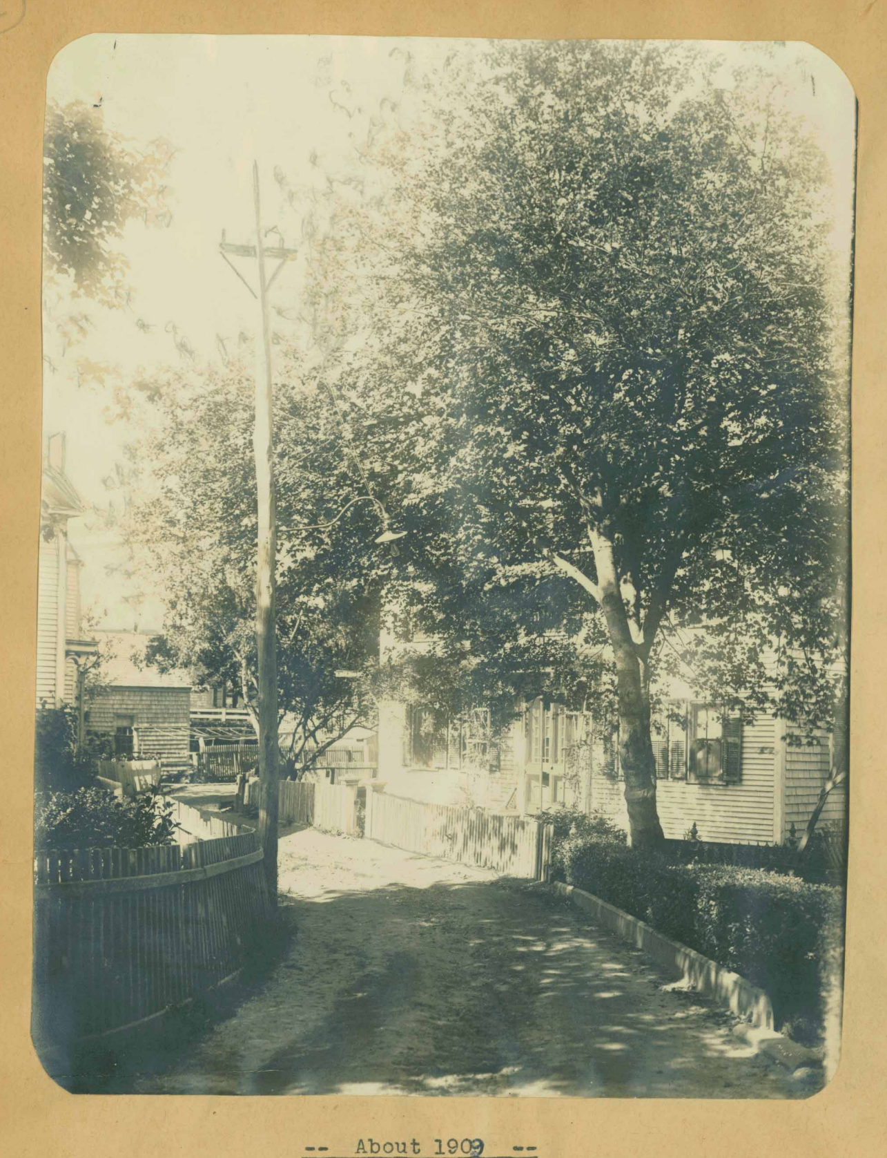
The "S curve" on Freeman Street going towards Bradford Street