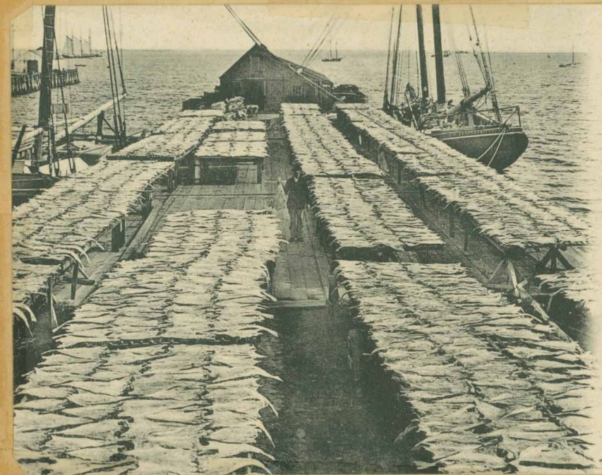
Drying Codfish, Provincetown, Mass.

PROVINCETOWN, May 14—There is more than meets the eye in the mellow J. D. Hilliard Company Inc. building at 337 Commercial Street. The structure, built about 103 years ago, antedates both the main square and the main street of Provincetown and in addition to once housing a ship chandlery, the building was headquarters for a fleet of Hilliard Grank Bankers and whaling vessels.