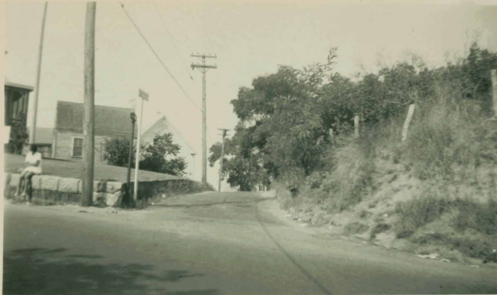
Looking up Prince Street ---- September 1948