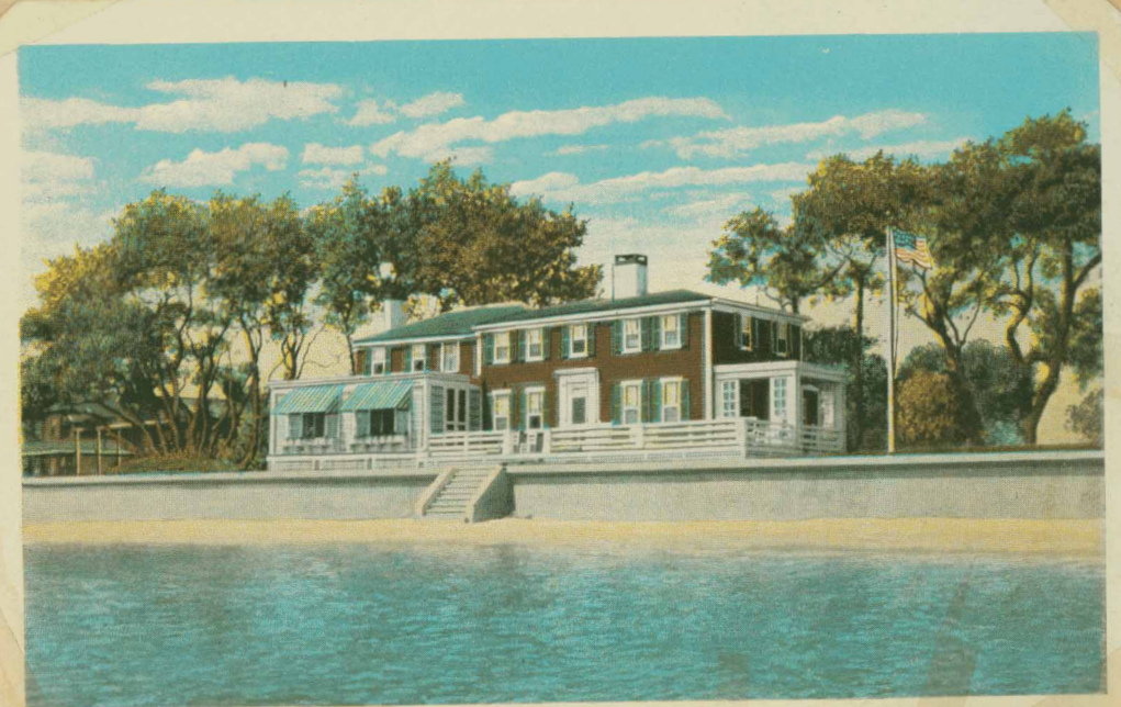
THE RED INN, PROVINCETOWN, MASS.