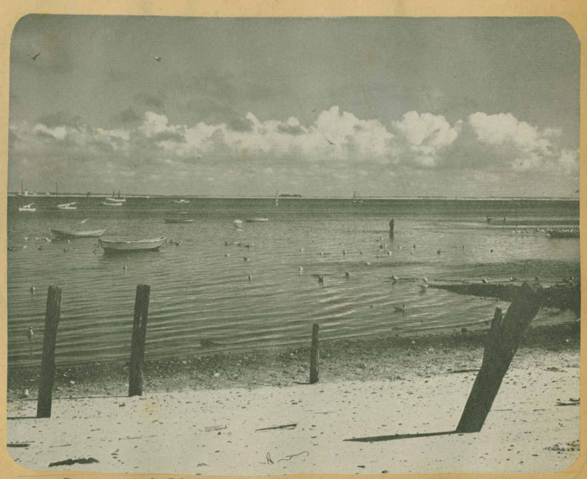
Long Point Lighthouse from behind Red Inn -1951