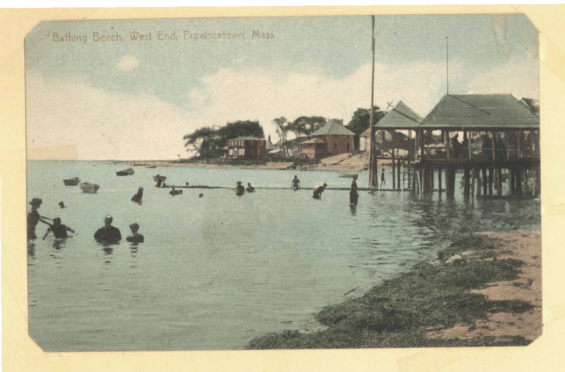
Ellis Bathing Beach - 1912 - Red Inn, background