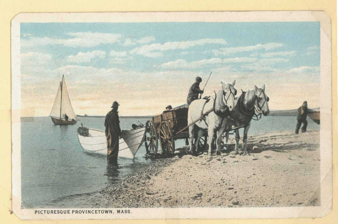
Bringing in the Nets - 1921