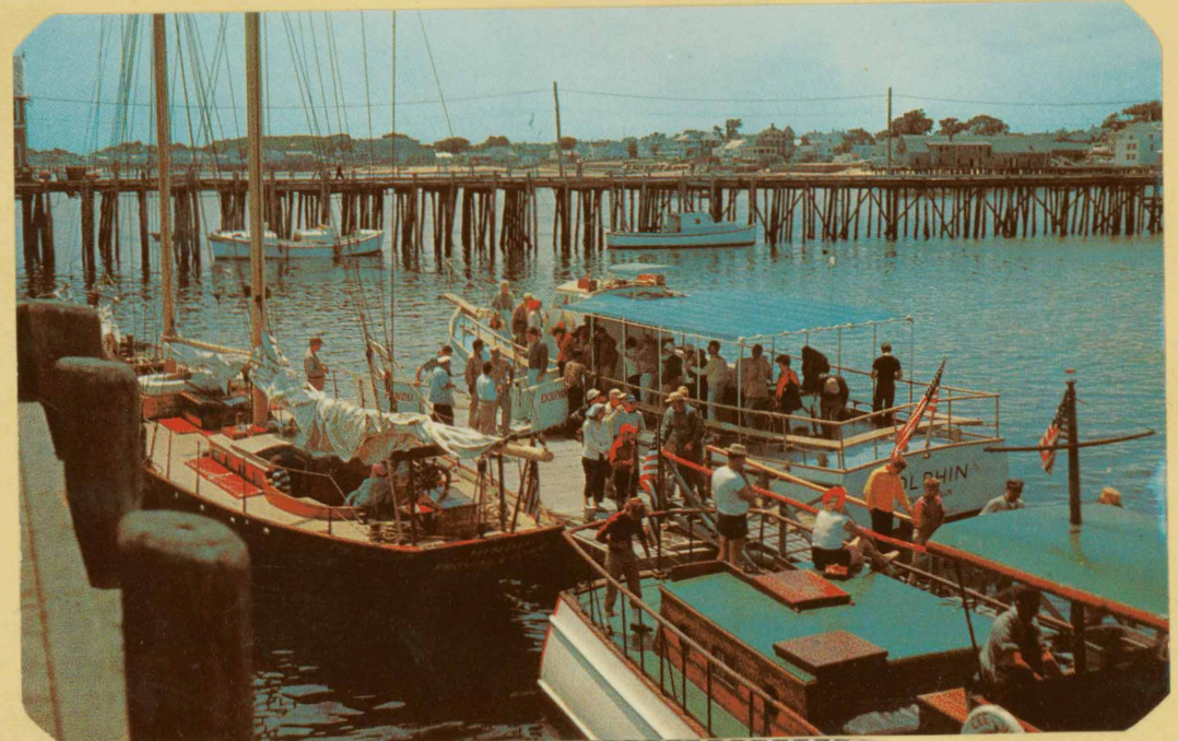
- 1957 -