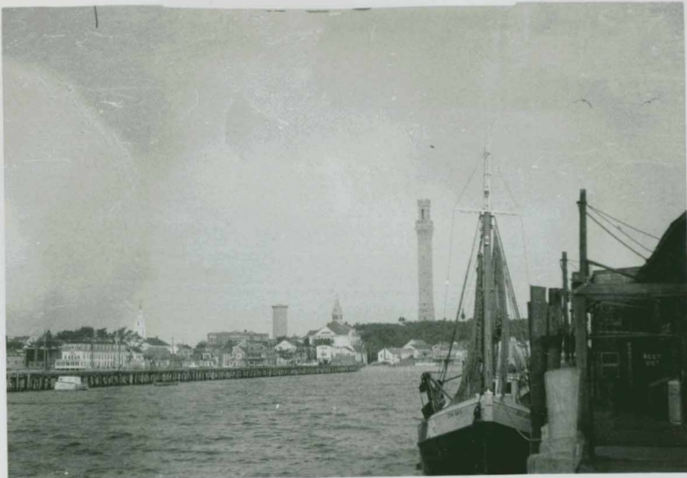
Left to right: Towne House - Universalist Church - High School - Stand Pipe - Town Hall and Monument. - September 1955 -