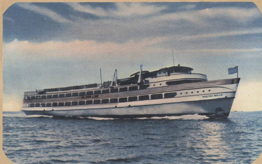
New address—ROWES WHARF Luxury Liner "Boston Belle"