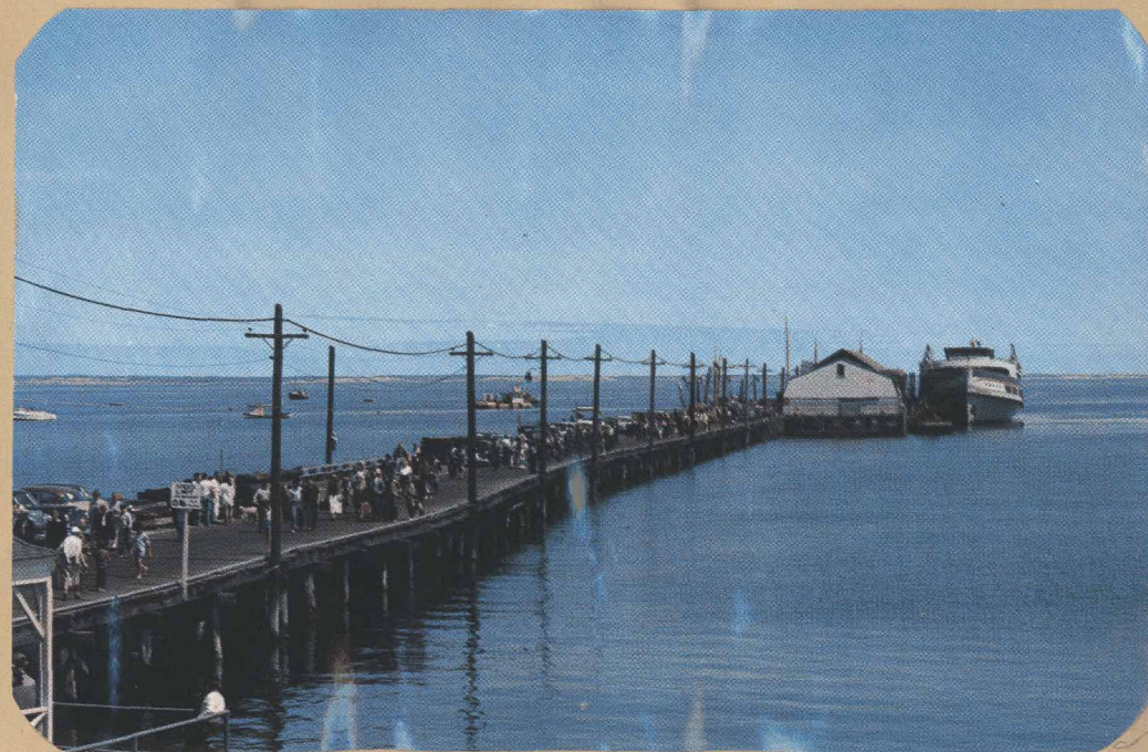
The Boston Belle at Town Wharf - 1954

America's newest, ultra-modern, radar equipped, all-steel, luxurious "Princess Liner," serving artistic PROVINCETOWN. Capacity 3,000 . . . immaculately clean . . . spacious SUN DECK . . . ultimate in solid comfort and relaxation. Nightly MOONLIGHT Dance Cruises, except Sunday, with music by New England's finest orchestras in the World's Largest Marine Ballroom.