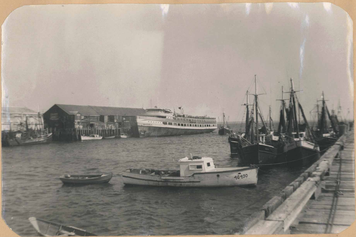
The Boston Belle from Sklaroff's Wharf - September 1952