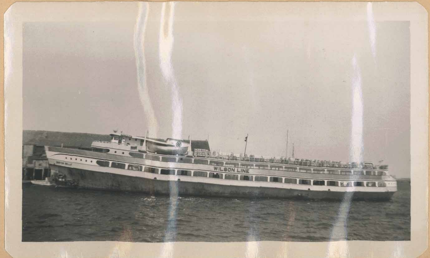
The Boston Belle from Sklaroff's - Sept. 1952