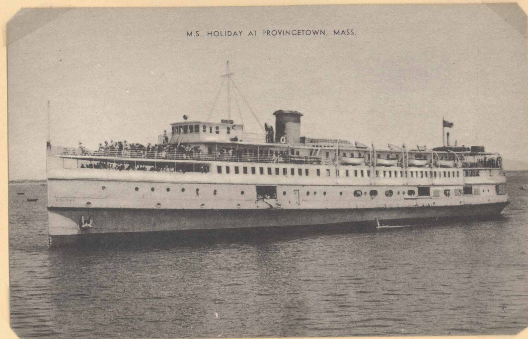
The M. S. Holiday. Her last run was in September 1949