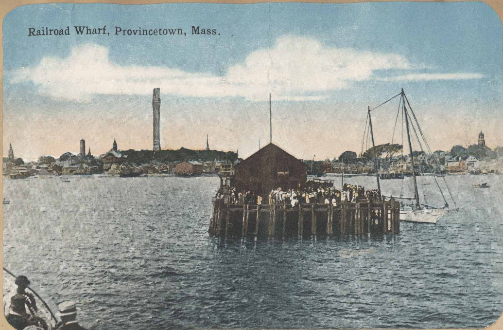
From the deck of the Cape Cod(lower left) - 1902.