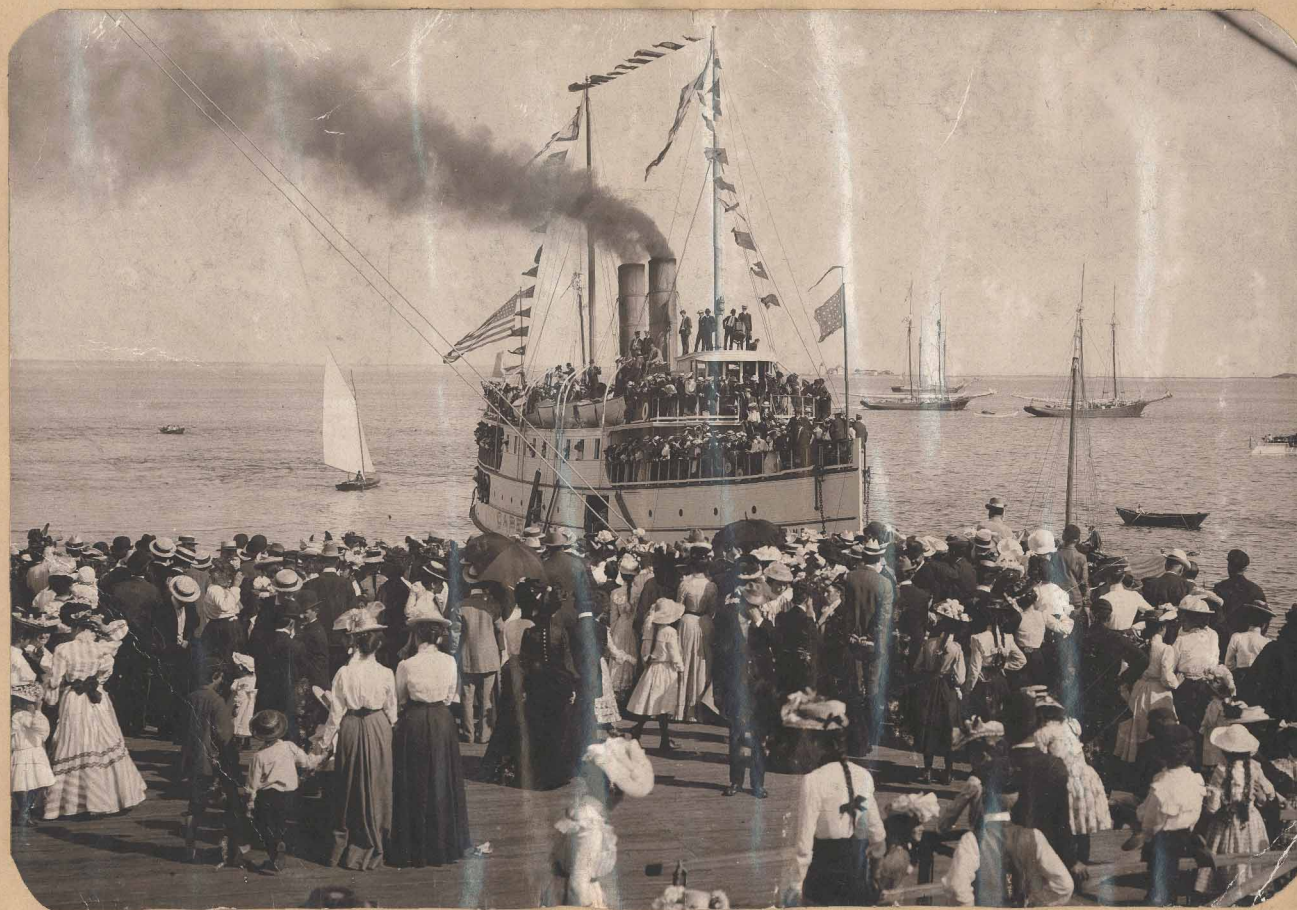
The Cape Cod about to dock. - 1902

The work of completing the new steamer Cape Cod, which was towed to East Boston from the builder's yard at Essex last week, is progressing rapidly. The weather the past week has assisted materially in expediting the work and already the four boilers are in position and the other work well in hand.