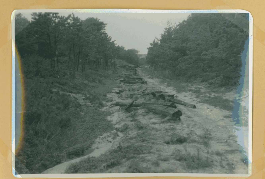
Taking up the Ties - October 1961 -

tried to set it afire several times. The chief said it was a drill for the personnel of Pumper No.