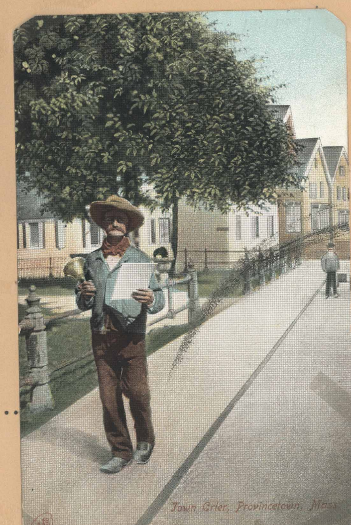
Ready in front of Town Hall..