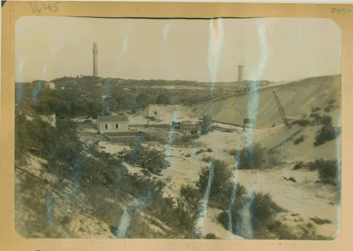
The Town Sandpit, the Monument and the Standpipe from the hill before Power House shown below. - September 1940 -