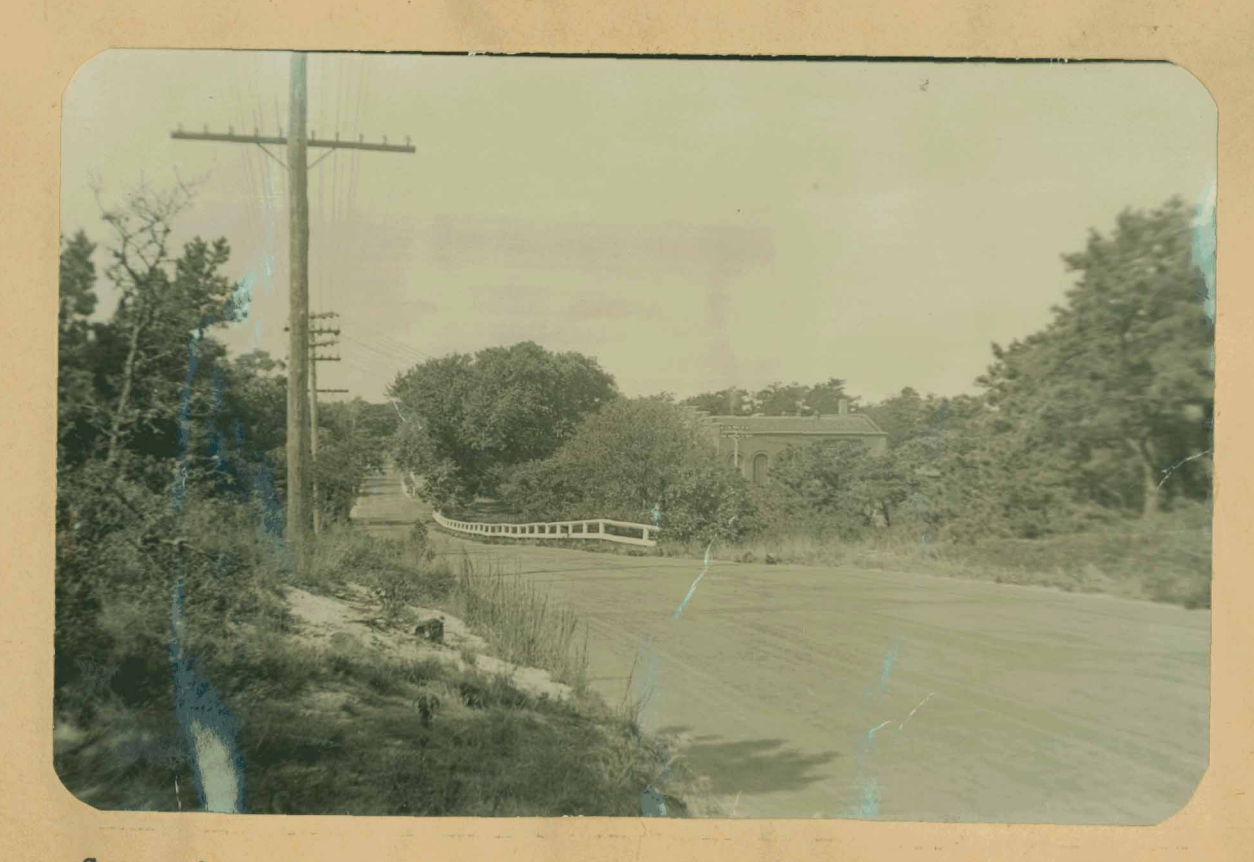
Same view from the same place - September 1944. Note trees in front of power house, and in preceding picture. This is the Provincetown Light & Power Works now, the Pumping Station now being over in North Trure by the R.R.