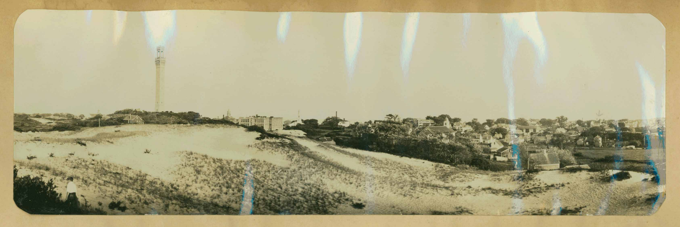
From the vicinity of the Standpipe. Pilgrim Monument, left. Town Hall. New high school. Universalist Church. Smokestack of the Colonial Cold Storage. The Gifford House comes next, with the Catholic Church on its right. To the far right can be seen the old Governor Bradford School.