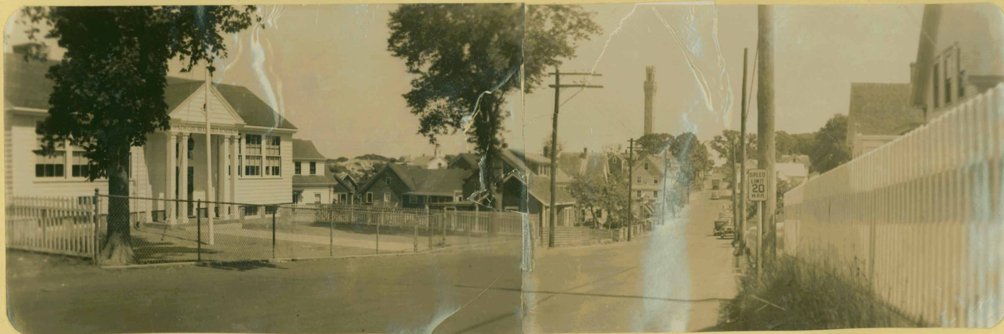
The New Governor Bradford School, built 1935, on the same spot, from below Conant Street, facing East. To right of school is St. Peter's Catholic Church on Prince St. - August 1940