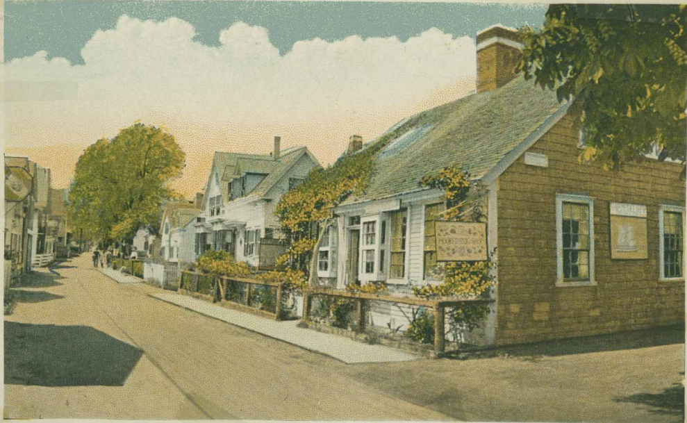
Soper Street, right. -- 1925 -- Arrow: Capn Jack's Wharf. Octagon Inn is on right corner of Soper St.