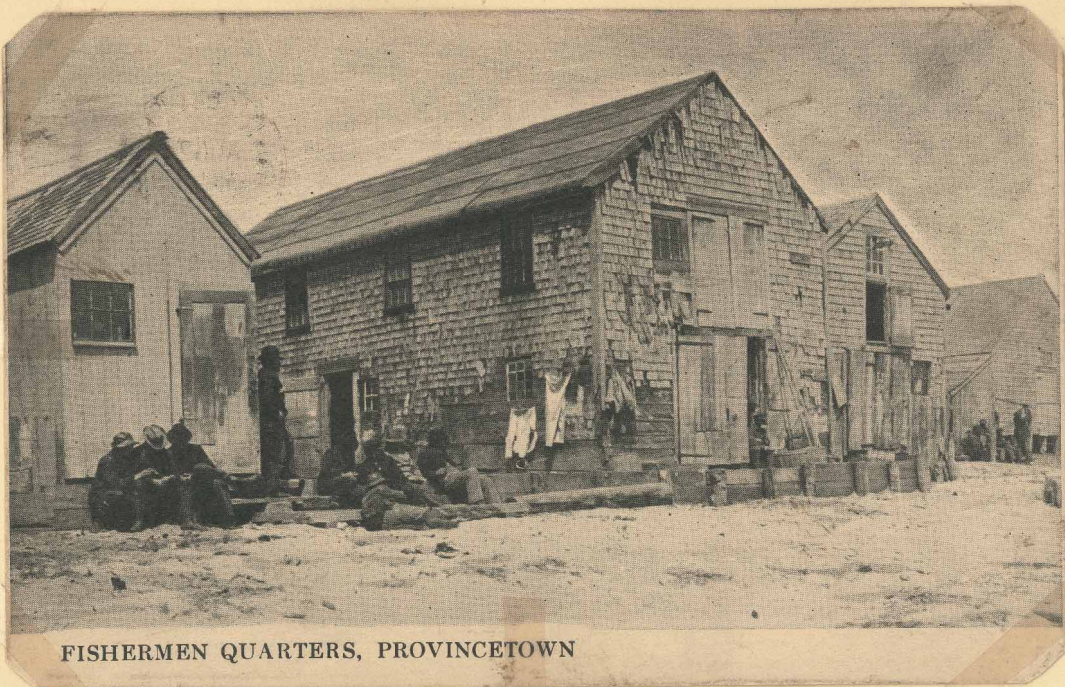
FISHERMEN QUARTERS, PROVINCETOWN