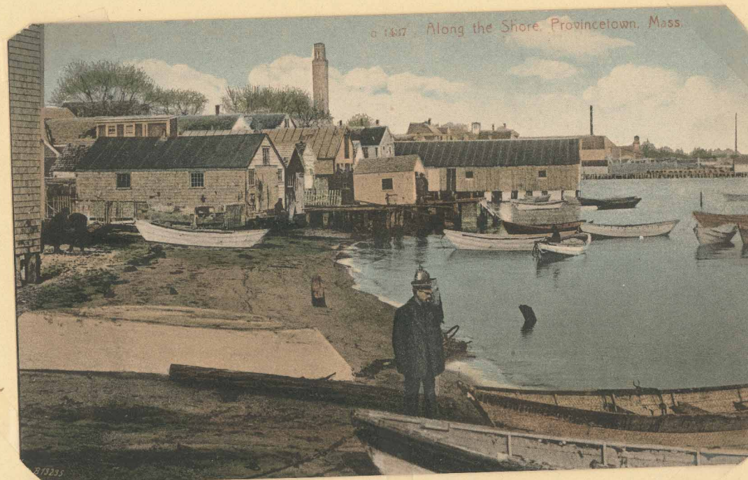
Along the Shore, Provincetown, Mass.