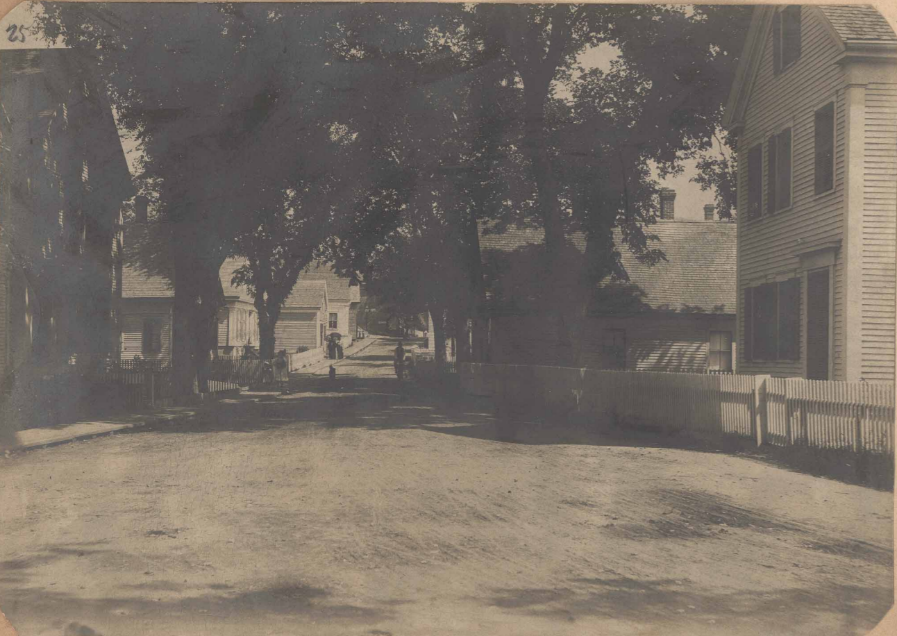
Same view as above - About 1900 - Note lovely elm Trees