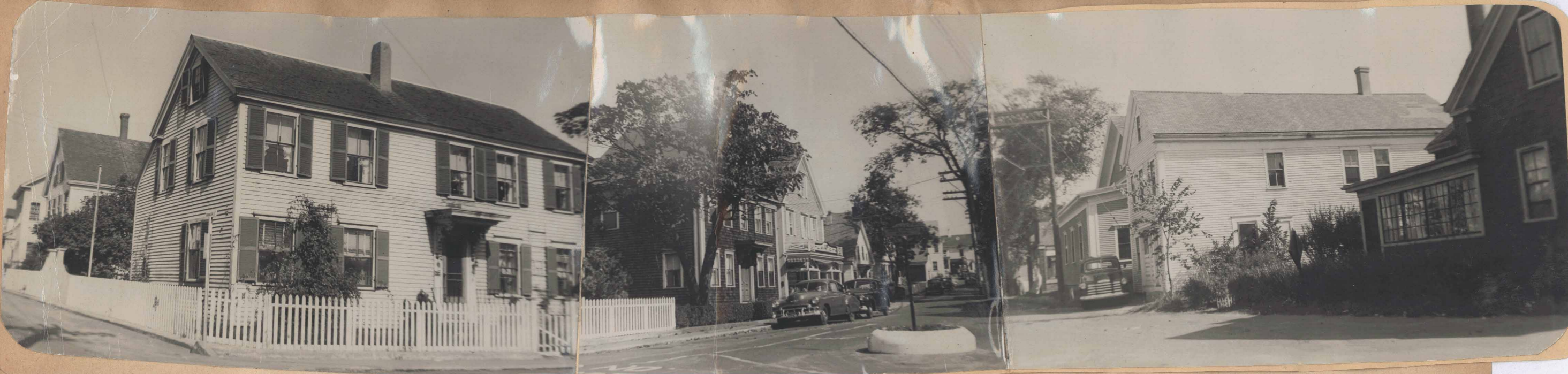
From Franklin Street (left) looking East. The square at The Turn. September 1949. The Cape Cod Cold Storage, 3rd from right, behind car. The A & P store, over the two cars on left. Note center where tree used to be. (See preceding pages.)